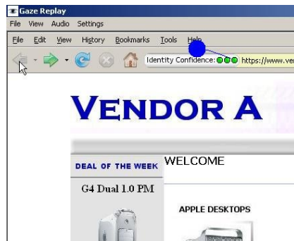
Fig. 3. A screenshot of the eye tracker replay function. The large circle near the identity confidence indicator shows the participant's fixation on that region of the screen.

In addition to the identity indicators being studied, seven participants also reported using the traditional indicators (the lock icon or https ) to help make decisions about identity and trust. The eye tracker data confirmed that these users did in fact fixate their gaze on the appropriate co-ordinates throughout the 7 tasks. There were also 4 participants who did not report using the traditional indicators in their decision-making but whose gaze fixated on their co-ordinates during most tasks.